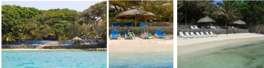
San Pedro de Majagua Island

One hour across the Bay of Cartagena, we arrive at the beautiful San Pedro de Majagua Islands. Only minutes away is the aquarium (Optional visit), where you can see the different species of marine life found in our waters. The stop includes a dolphin and shark show. At a private island, you will have lunch. Departure at 07:45 and return at 15:00.