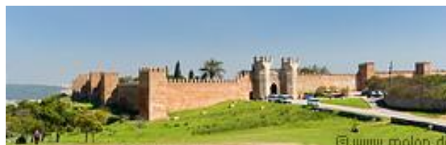
Chellah Archaeological Site

20:00-23:00 Gala Dinner : A Taste of Morocco