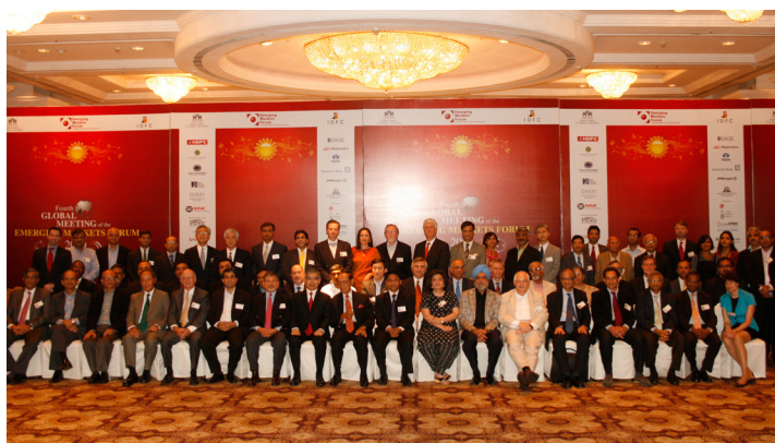
The 2009 "Class" Photo

We hope that you will find these arrangements satisfactory and consistent with our commitment to protect your privacy and ensure the confidentiality of our proceedings.