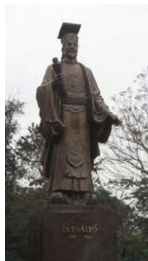
Ly Thai To statue in Hanoi