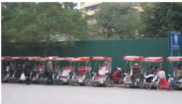
Popular mode of transportation: Bicycle Rickshaws

Vietnam's annual GDP is $222.5 billion (2007 est) at purchasing power parity. Vietnam is also the largest producer of cashew nuts with a one-third global share and second largest rice exporter in the world after Thailand. Vietnam has the highest percent of land use for permanent crops, 6.93%, of any nation in the Greater Mekong Sub region.