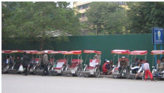
Popular mode of transportation: Bicycle Rickshaws

Vietnam's annual GDP is $222.5 billion (2007 est) at purchasing power parity. Vietnam is also the largest producer of cashew nuts with a one-third global share and second largest rice exporter in the world after Thailand. Vietnam has the highest percent of land use for permanent crops, 6.93%, of any nation in the Greater Mekong Subregion.