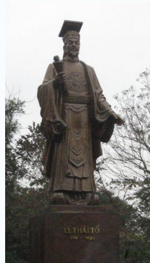
Ly Thai To statue in Hanoi